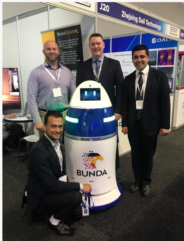
Security Robot in Sydney

Marketing Team Southern Cross Group +61 2 9008 2692 email us here Visit us on social media: Facebook Twitter LinkedIn