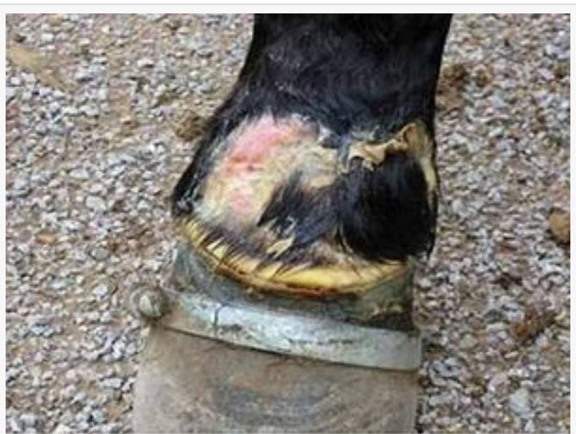
Example of soring that enforcement of the Horse Protection Act would prevent