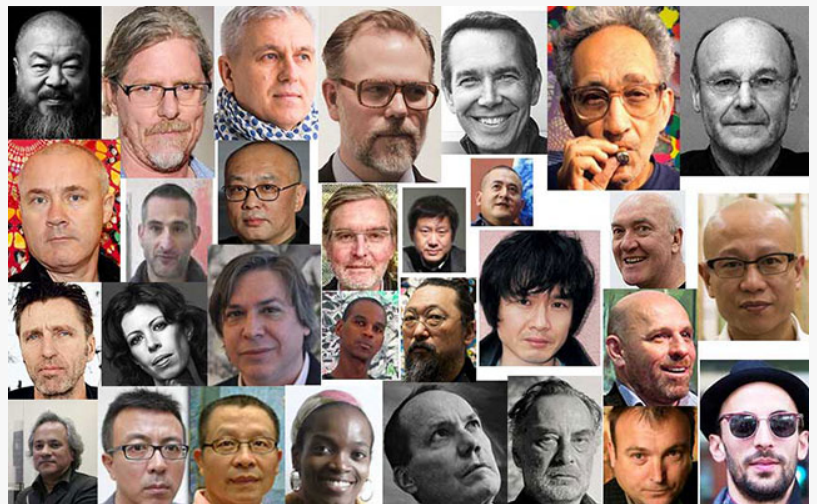
30 Influential And Famous Contemporary Artists And Their Art

Contemporary art is the art of the present, produced by living artists in the twenty-first century. It provides an opportunity to reflect on today social issues relevant to humanity, and the world