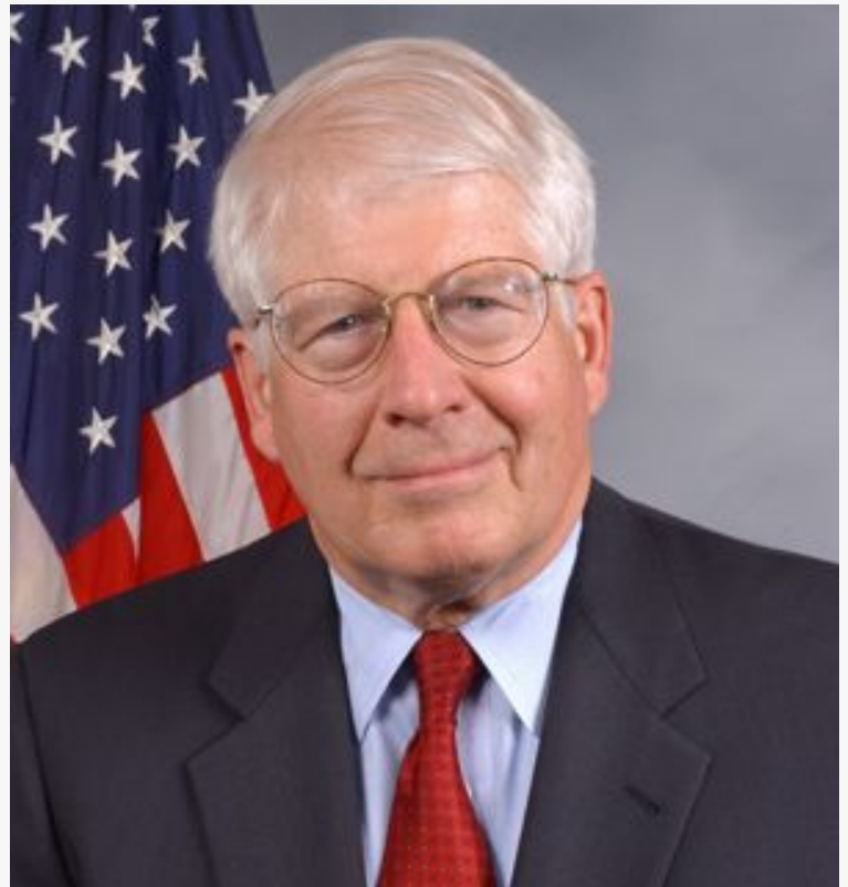
U.S. Rep. David Price (D-NC-04)

See what Members of Congress from across the nation have to say about the PAST Act by