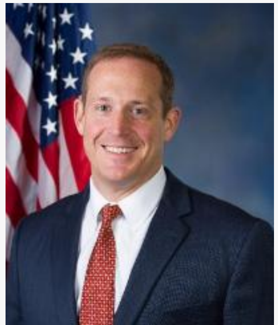
U.S. Rep. Ted Budd (R-NC-13)

The measure seeks to strengthen the Horse Protection Act and end the torturous, painful practice of soring Tennessee Walking, Racking, and Spotted Saddle Horses. Soring, the intentional infliction of pain to horses' front limbs by applying caustic chemicals such as mustard oil or kerosene or inserting sharp objects into the horses' hooves to create an exaggerated gait known as the "Big Lick," has plagued the equine world for six decades, and is exhibited throughout the Tarheel State and highlighted at the North Carolina Championship Horse Show in Fletcher each October.