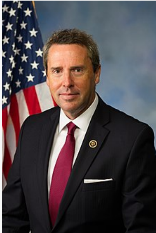
U.S. Rep. Mark Walker (R-NC-06)

The PAST Act has been blocked for years by a handful of well-placed lawmakers, but a new House rule triggering consideration of any measure that attracts 290 or more cosponsors brought the issue to the floor. PAST attracted 308 cosponsors, and was led by U.S. Reps. Kurt Schrader (D-OR) and Ted Yoho (R-FL), cochairs of the Congressional Veterinary Medicine Caucus, along with Reps. Steve Cohen (D-TN), Ron Estes (R-KS), Jan Schakowsky (D-IL), and Chris Collins (R-NY). The Senate companion is led by U.S. Sens. Mike Crapo (R-ID) and Mark Warner (D-VA) has garnered 40 cosponsors.