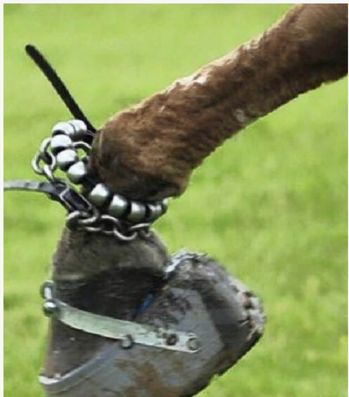
Example of a 'Big Lick' stacked shoe and ankle chains

This press release can be viewed online at: http://www.einpresswire.com