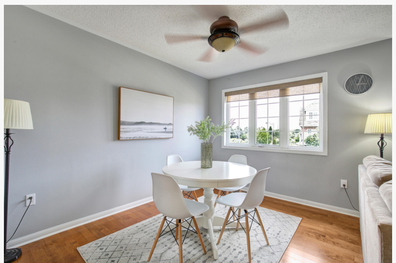
106 Decker Hollow Circle Is Going Up For Auction

Even Realtors representing buyers who have 'lost' at auction have noted that the process is considerably more comfortable versus blind bidding wars. "It was actually fun," said one participating Realtor out of Brampton. "We didn't win, but we knew we went to our best price and could walk away once it got too high. So much better than waiting all night with no information."