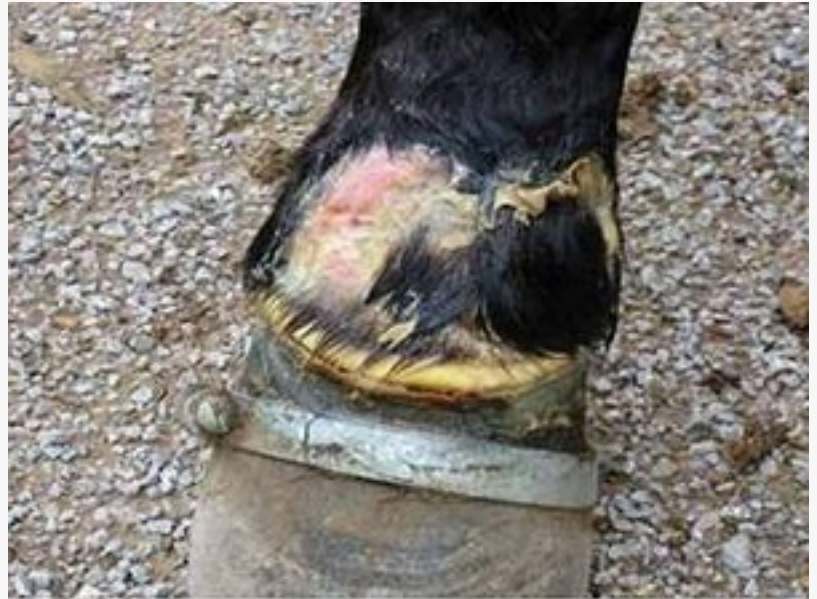
Example of soring that the PAST Act would prevent