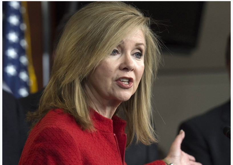
U.S. Senator Marsha Blackburn