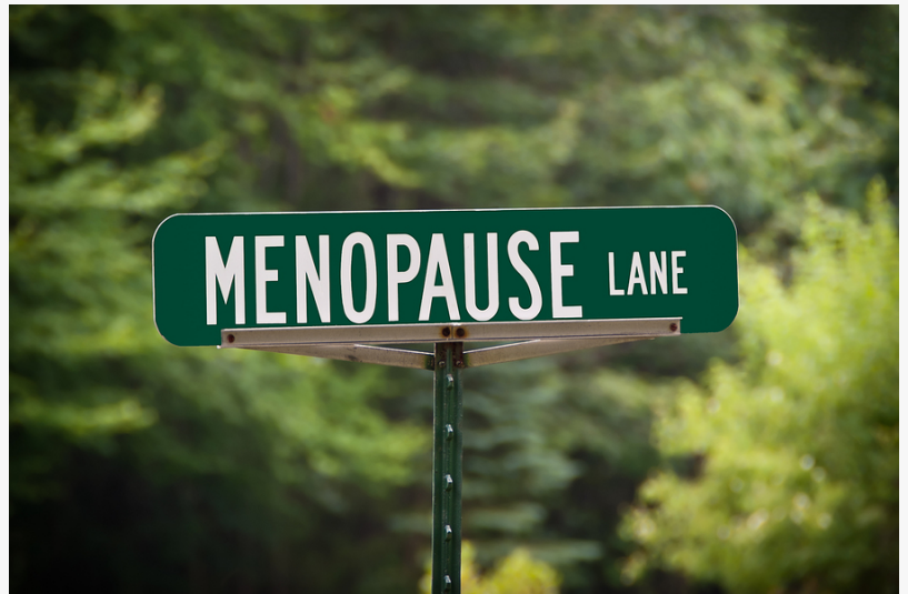
Dont get stuck in Menopause Lane

Well, a New Zealand based manufacturer, Regenex Laboratories, claim to have formulated the magic pills you seek. And it seems our neighbours from 'down under' have been enjoying the bliss of symptom free menopause for quite some time, but now we ladies of North America might be able to try it for ourselves.