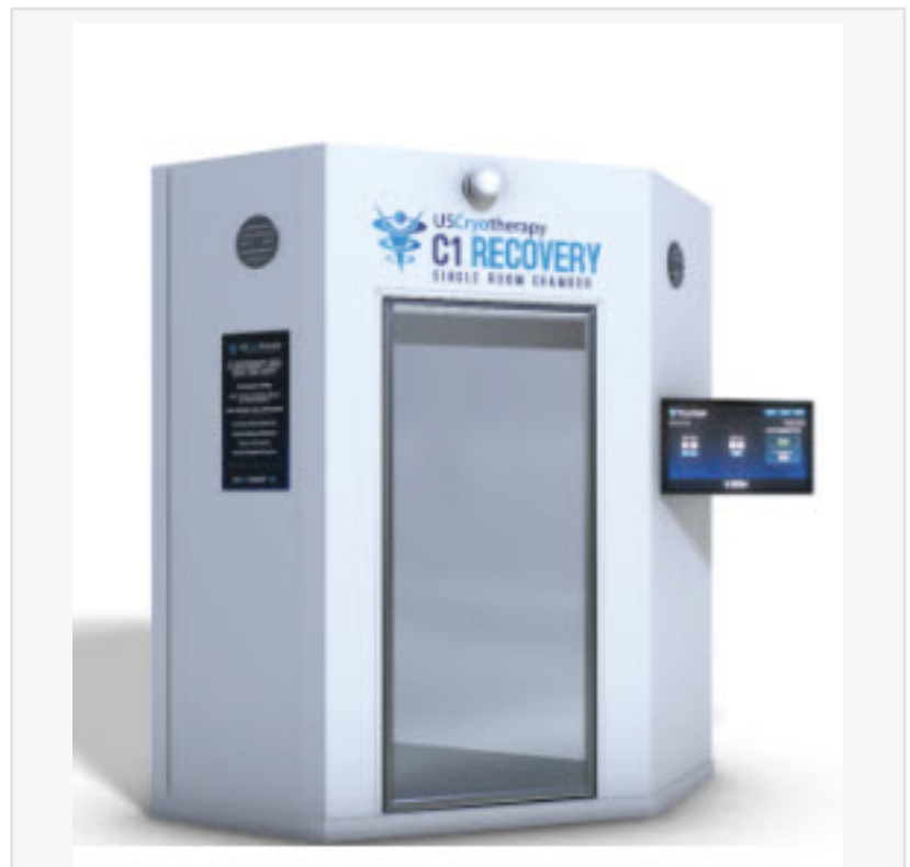
C1 Single Room Chamber by US Cryotherapy

US Cryotherapy's cold air treatments offer a unique, convenient, and energizing treatment which promotes faster recovery and better health. Whole Body Cryotherapy (WBC) offered by US Cryotherapy is exposure to subzero temperatures in a walk-in chamber using refrigerated cold air with NO use of hazardous liquid nitrogen or chemicals. The entire body is exposed (including chest, neck, and head during the short duration session which uniformly cools the entire body). The Cold Shock Therapy stimulates skin sensors, activating a Central Nervous System (CNS) response, which causes the release of endorphins, the body's natural pain inhibitors and mood elevators, accelerating recovery while elevating mood and energy. Elite athletes and the public have adopted Whole Body Cryotherapy treatments as a holistic new way to treat the body by stimulating self-repair while rejuvenating the body, mind, and skin. US Cryotherapy has safely treated nearly 1.5 million customers since founding the industry in early 2011. They started and lead the movement of the holistic wellness/alternative healthcare center, with safe whole body cryotherapy complemented by other elite modalities to accelerate recovery through the inclusion of localized cold air spot treatments, facial rejuvenation, compression, vibration, deep muscle pulsation, photobiomodulation and pulse electromagnetic therapies to its customers at the most affordable price points in the industry.