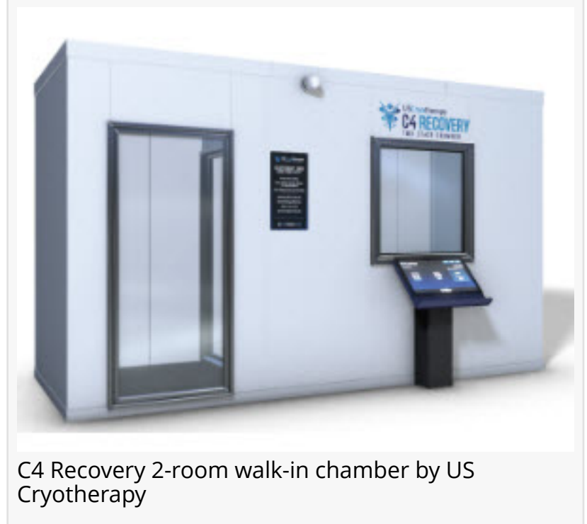
C4 Recovery 2-room walk-in chamber by US Cryotherapy