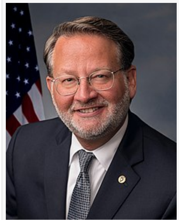
U.S. Senator Gary Peters

U.S. Senator Gary Peters is a longtime cosponsor of the Senate companion bill, S. 1007, that mirrors the House passed legislation, but U.S. Senator Debbie Stabenow, Ranking Member of the Senate Agriculture Committee, has yet to cosponsor the measure.