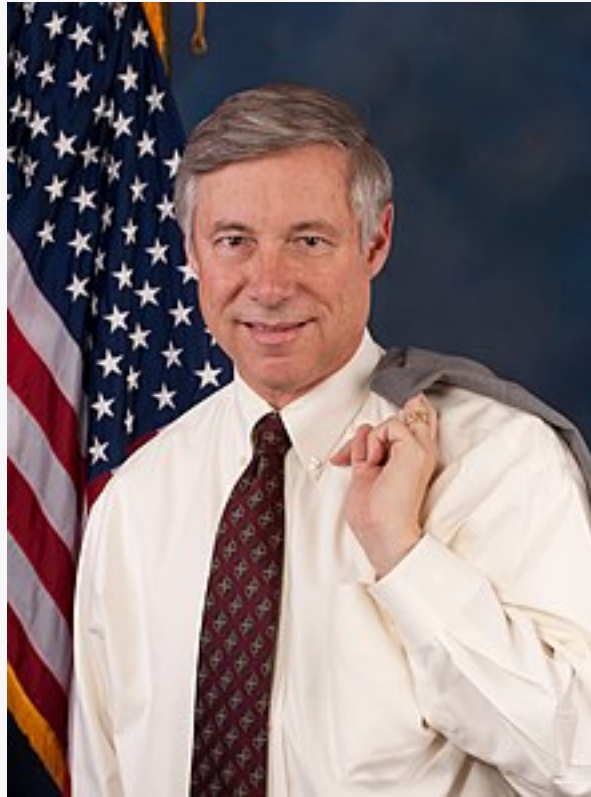
Rep. Fred Upton

The PAST Act has been blocked for years by a handful of well-placed lawmakers, but a new