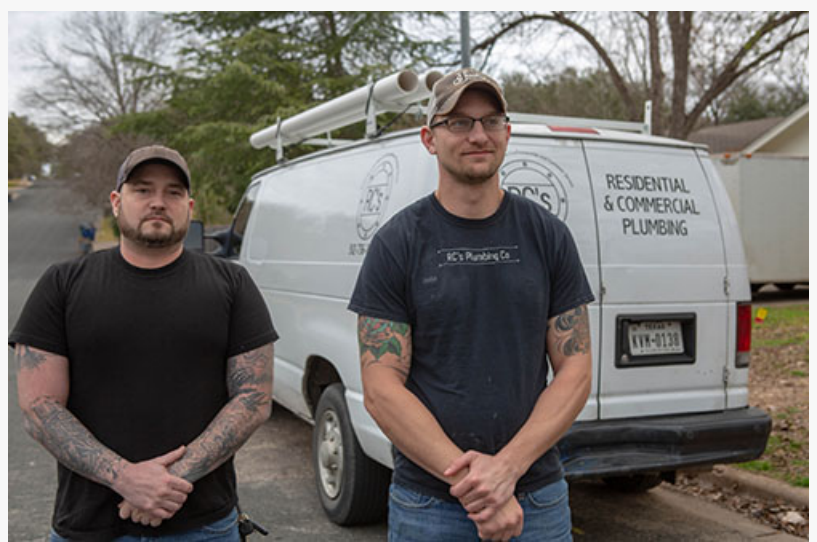
RC Plumbing in Austin

Another problem with online reviews and ratings is that some of these sites may be less than completely reliable. A site may take money in return for favorable reviews, or may have been set up give only positive reviews. Any low-traffic web site could even be slanted to favor a particular vendor. It's worthwhile to trust recommendations only from high-traffic web sites with well-established reputations to protect.