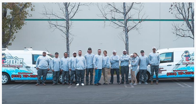
Tip Top Drain Pro Team

Recurring Clogged Drains or Toilets: Any drain can clog up at any time. But when clogs occur repeatedly, and are extra difficult to clear, your sewer may be sending you a red flag warning of impending problems.