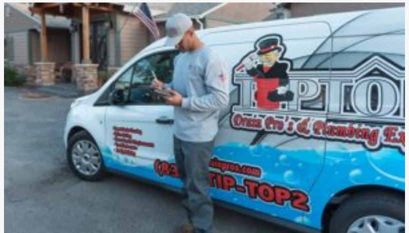
Tip Top Drain Pro Truck