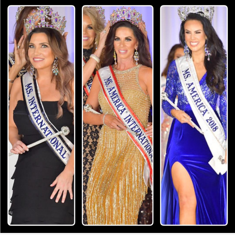
2018 National Titleholders