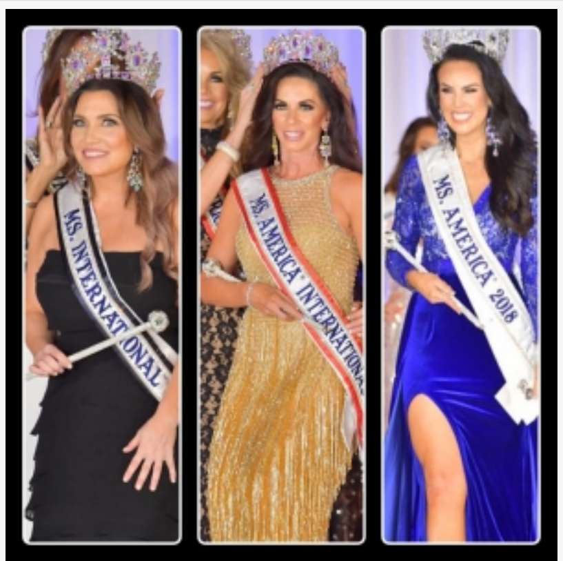
Ms. America - Ms. America International and Ms. International 2018