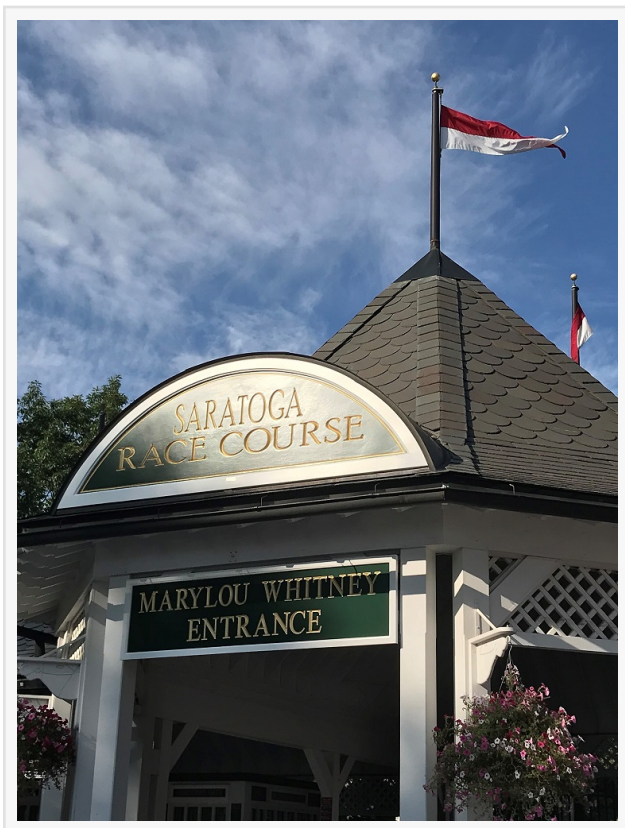
Saratoga Race Course Marylou Whitney Entrance on the eve of The Jockey Club's Round Table

This press release can be viewed online at: http://www.einpresswire.com