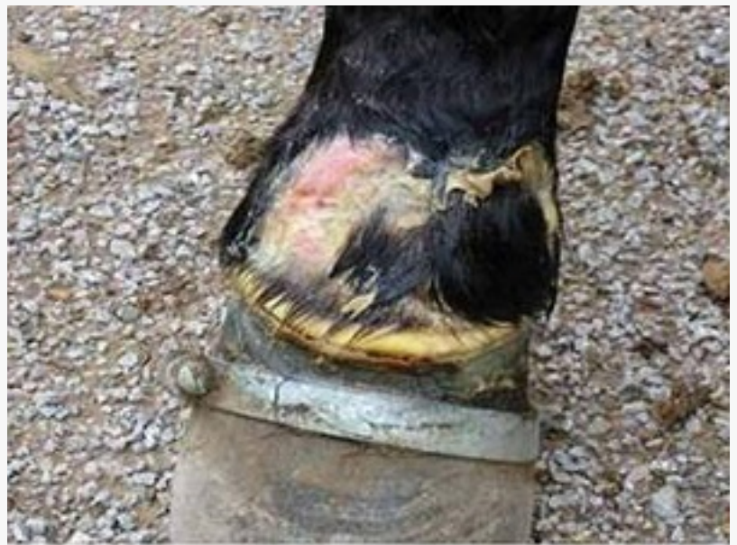
Example of soring that enforcement of the Horse Protection Act would prevent

COLUMBIA , SOUTH CAROLINA , USA, August 13, 2019 /EINPresswire.com/ -- The U.S. House of Representatives recently passed the Prevent All Soring Tactics (PAST) Act, H.R. 693, by a vote of 333 to 96 . U.S. Reps. Ralph Norman, William Timmons, and Jeff Duncan sided with animal abusers voting against the measure while bipartisan U.S. Reps. Joe Cunningham, Joe Wilson, Jim Clyburn, and Tom Rice voted in support of the bill. Reps. Jeff Duncan and Joe Cunningham were both cosponsors of the measure that in a peculiar reversal of his position, Duncan ultimately voted against.