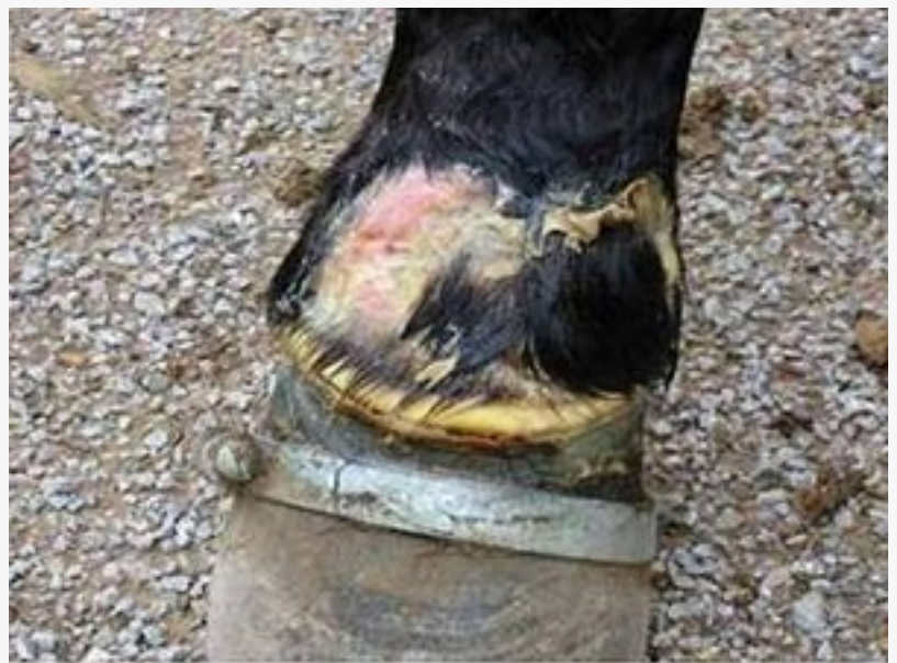
Example of soring that enforcement of the Horse Protection Act would prevent

The Animal Wellness Foundation (Foundation) is a Los Angeles-based private charitable organization with a mission of helping animals by making veterinary care available to everyone