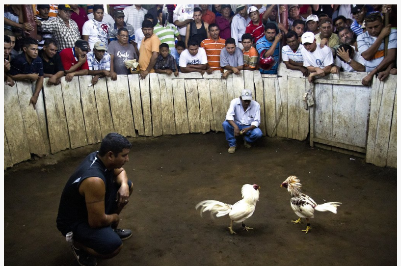
Many liken "Big Lick" soring events to cockfighting pictured

causes that alleviate the suffering of companion animals, farm animals, and wildlife. We advocate for policies to stop dogfighting and cockfighting and other forms of malicious cruelty and to confront factory farming and other systemic forms of animal exploitation. To prevent cruelty, we promote enacting good public policies and we work to enforce those policies. To enact good laws, we must elect good lawmakers, and that's why we remind voters which candidates care about our issues and which ones don't. We believe helping animals helps us all.