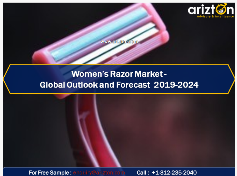
Women Razor Market Report 2024