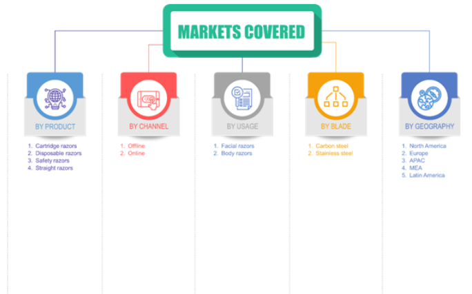
Women razor market segments share 2024