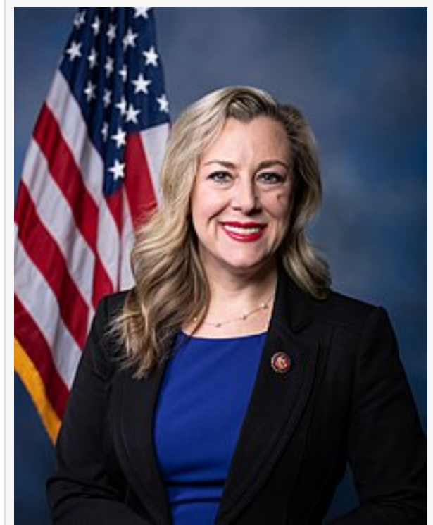
U.S. Rep. Kendra Horn

U.S. Senators Jim Inhofe and James Lankford have yet to take a position on the Senate companion bill, S. 1007, led by the senior U.S. Senator from Idaho, Republican Mike Crapo, that mirrors the House passed legislation.