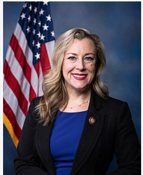
U.S. Rep. Kendra Horn