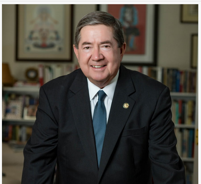
Former Oklahoma Attorney General, and co-chair of the Animal Wellness Law Enforcement Council Drew Edmondson

The Animal Wellness Foundation (Foundation) is a Los Angeles-based private charitable organization with a mission of helping animals by making veterinary care available to everyone with a pet, regardless of economic ability. We organize rescue efforts and medical services for dogs and cats in need and help homeless pets find a loving caregiver. We are advocates for getting veterinarians to the front lines of the animal welfare movement; promoting responsible pet ownership; and vaccinating animals against infectious diseases such as distemper. We also support policies that prevent animal cruelty and that alleviate suffering. We believe helping animals helps us all.