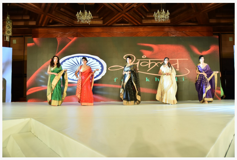
Models wearing handlooms from Madhya Pradesh at the Fashion Show 'Roots of India' at Signature for Khadi initiative

who gathered as a gesture for celebration for 100 years of Charkha and to inscribe their signatures on the Khadi canvas with a message, "I endorse Khadi too" to invoke the feeling of