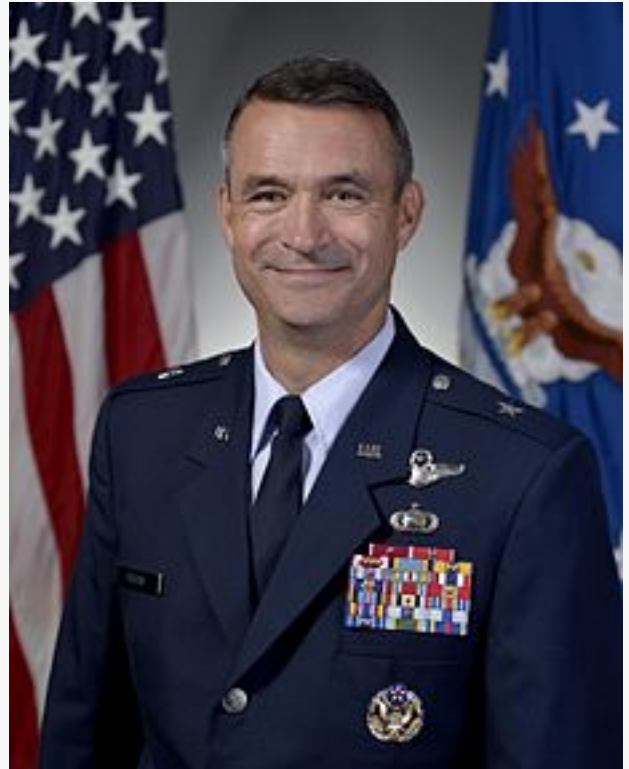
Rep. Don Bacon

The Animal Wellness Foundation (Foundation) is a Los Angeles-based private charitable organization with a mission of helping animals by making veterinary care available to everyone with a pet, regardless of economic ability. We organize rescue efforts and medical services for dogs and cats in need and help homeless pets find a loving caregiver. We are advocates for getting veterinarians to the front lines of the animal welfare movement; promoting responsible pet ownership; and vaccinating animals against infectious diseases such as distemper. We also support policies that prevent