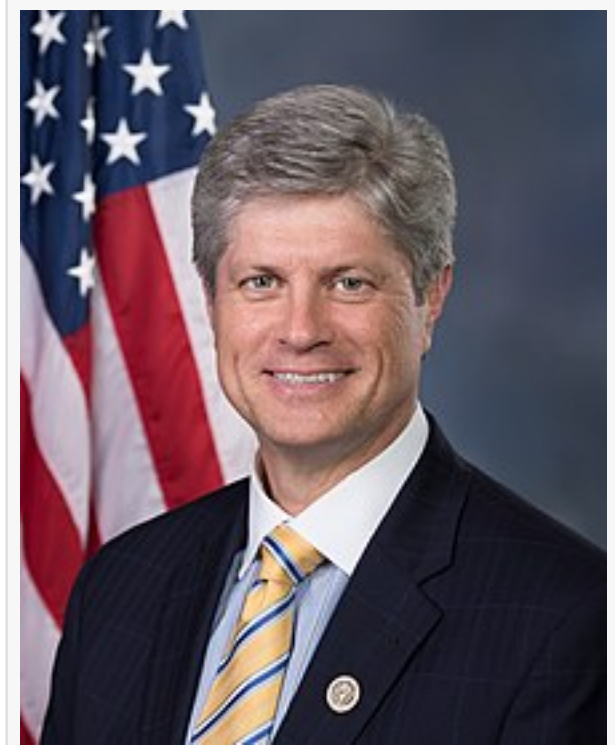
Rep. Jeff Fortenberry

president of the Tennessee Walking Horse Breeders' & Exhibitors' Association. “We're not one bit surprised that Adrian Smith sided with abusers based on his long-term record against horses, but the landslide support for the bill is a powerful signal to the U.S. Senate that it should saddle up and end this cruelty to horses once and for all.”