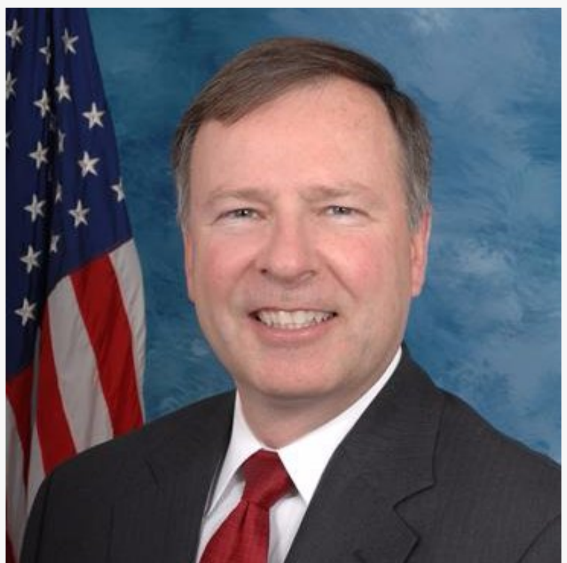
Rep. Doug Lamborn

The PAST Act has been blocked for years by a handful of well-placed lawmakers, but a new House rule triggering consideration of any measure that attracts 290 or more cosponsors brought the issue to the floor. PAST attracted 308 cosponsors, and was led by U.S. Reps. Kurt Schrader (D-OR) and Ted Yoho (R-FL), cochairs of the Congressional Veterinary Medicine Caucus, along with Reps. Steve Cohen (D-TN), Ron Estes (R-KS), Jan Schakowsky (D-IL), and Chris Collins (R-NY). The Senate companion has garnered 43 cosponsors.