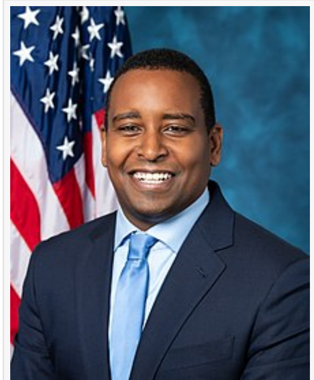
Rep. Joe Neguse

“I support the humane treatment of all animals and remain committed to ending the cruel