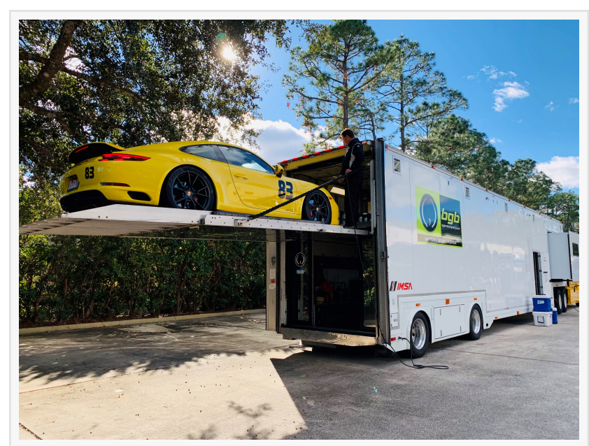
BGB Motorsports Jekyll and Hyde Build 991.2 Carrera GTS

How do you turn an ordinary 911 Carrera road car into a dual purpose street and track weapon that has two usable back seats? Can you create something equally as capable but less conspicuous than a traditional 911 GT3 for the street and race track? Last year Florida based Porsche specialists BGB Motorsports committed to the task of taking a 911 Carrera road car and uncorking it to run with its more track oriented big brother.