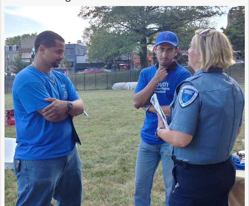
YHR DC Volunteers talking with police about human right education at National Night Out

International complements this work by addressing those issues with educational materials and activities. At the core of its campaign are the informational "What Are Human Rights?" booklets, introducing youth and adults to the 30 rights in the Universal Declaration of Human Rights, illustrated in simple and clear language. They are provided free of charge to millions of people annually and made available in 27 languages at <a href="https://www.youthforhumanrights.org/request-">https://www.youthforhumanrights.org/request-</a>