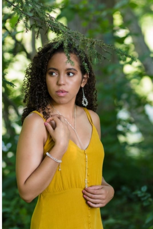
Model wearing clear pieces of jewelry.

Their collection also includes beautiful packaging that can be reused afterwards. Each individual necklace, bracelet, and earring has its own name. A few examples are: