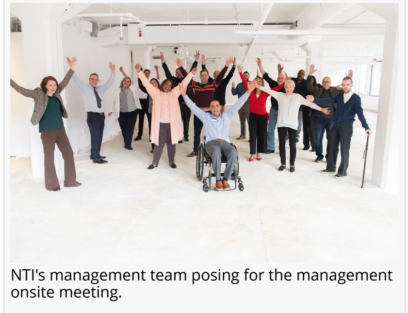
NTI's management team posing for the management onsite meeting.