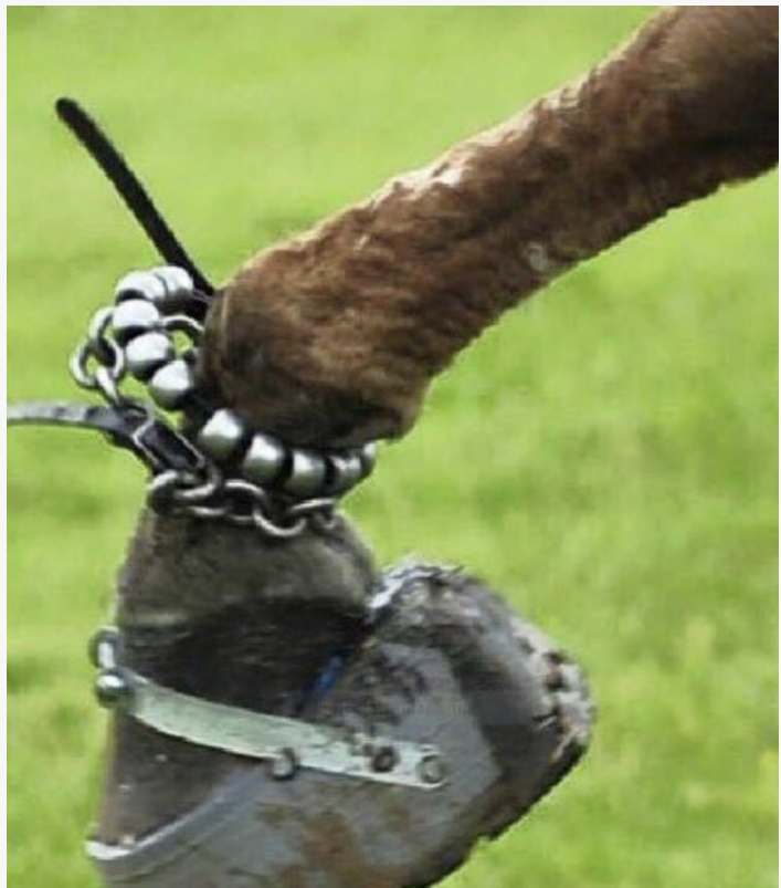
Big Lick Shoe and Ankle Chains the PAST Act Would Eliminate