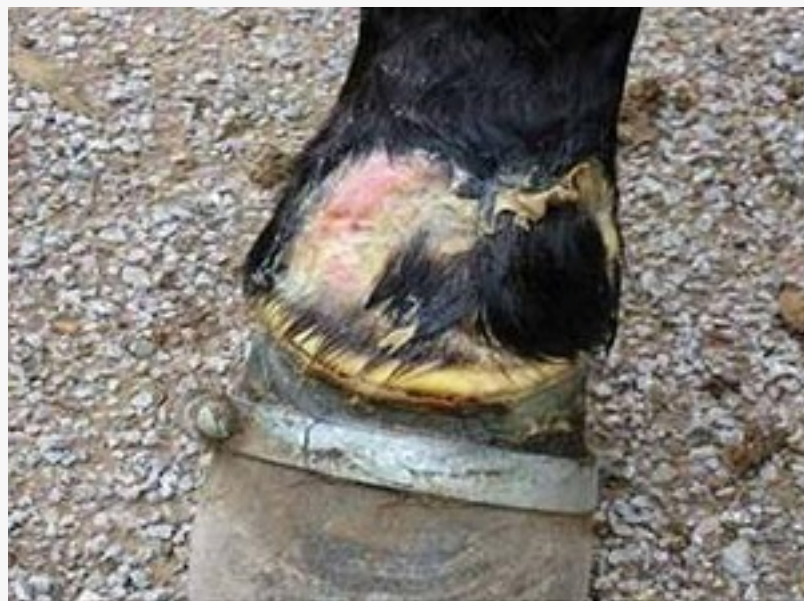
Example of soring that enforcement of the Horse Protection Act would prevent

This press release can be viewed online at: http://www.einpresswire.com