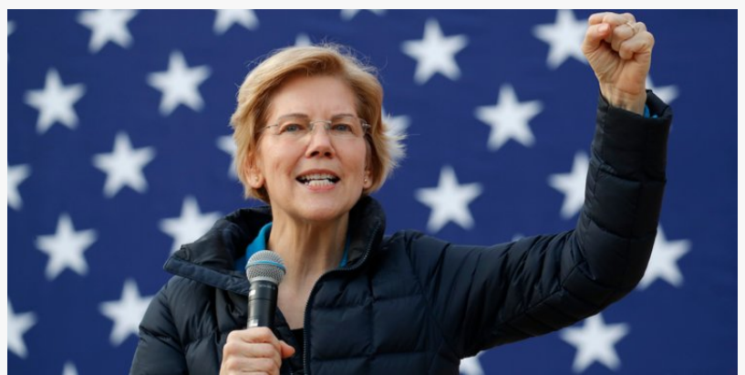
U.S. Senator Elizabeth Warren

BOSTON, MASSACHUSETTS , US, August 20, 2019 /EINPresswire.com/ -- The U.S. House of Representatives recently passed the U.S. Senator Joseph D. Tydings Memorial Prevent All Soring Tactics (PAST) Act, H.R. 693, by a vote of 333 to 96 . U.S. Reps. Jim McGovern, Richard Neal, Lori Trahan, Joe Kennedy, III, Katherine Clark, Seth Moulton, Ayanna Pressley, Stephen Lynch, and William Keating – the entire House Delegation from Massachusetts – all cosponsors of the bill – voted in support of the measure. Both U.S. Senators Ed Markey, and Elizabeth Warren are also co-sponsors of the Senate companion bill, S. 1007, that mirrors the House passed legislation.