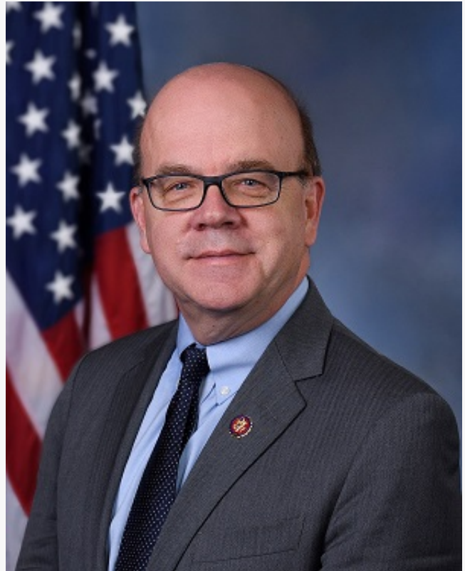
U.S. House Rules Committee Chairman, Jim McGovern

Animal Wellness Action (Action) is a Washington, D.C.-based 501(c)(4) organization with a mission of helping animals by promoting legal standards forbidding cruelty. We champion causes that alleviate the suffering of companion animals, farm animals, and wildlife. We advocate for policies to stop dogfighting and cockfighting and other forms of malicious cruelty