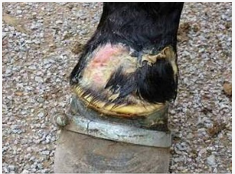
Example of soring that enforcement of the Horse Protection Act would prevent