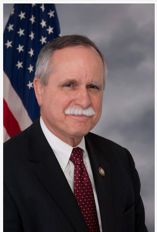
U.S. Rep. David McKinley