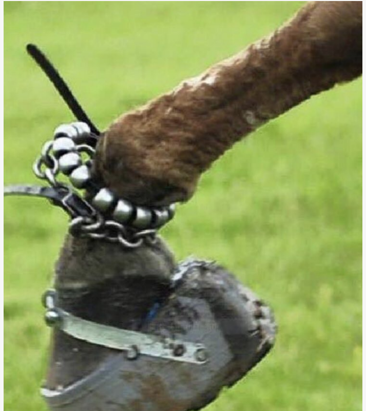
Devices the PAST Act would outlaw

Animal Wellness Action (Action) is a Washington, D.C.-based 501(c)(4) organization with a mission of helping animals by promoting legal standards forbidding cruelty. We champion causes that alleviate the suffering of companion animals, farm animals, and wildlife. We advocate for policies to stop dogfighting and cockfighting and other forms of malicious cruelty and to confront factory farming and other systemic forms of animal exploitation. To prevent cruelty, we promote enacting good public policies and we work to enforce those policies. To enact good laws, we must elect good lawmakers, and that's why we remind voters which candidates care about our issues and which ones don't. We believe helping animals helps us all.