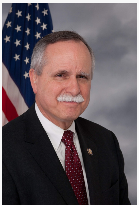
U.S. Rep. David McKinley