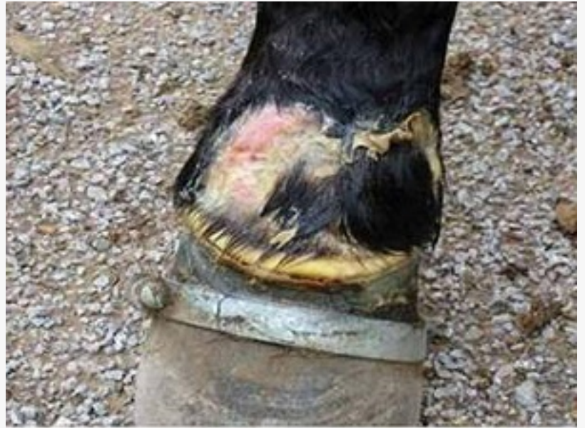
Example of soring that enforcement of the Horse Protection Act would prevent