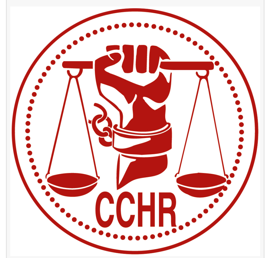
The Florida chapter of CCHR is a non-profit mental health watchdog dedicated to the protection of children.

consumer protections. L. Ron Hubbard, founder of Scientology, first brought psychiatric imprisonment to wide public notice: "Thousands and thousands are seized without process of law, every week, over the 'free world' tortured, castrated, killed. All in the name of 'mental health," he wrote in March 1969.