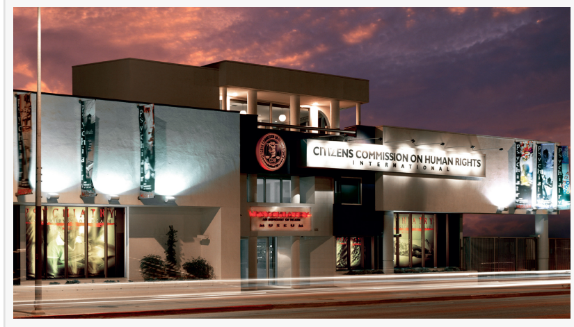
CCHR's mission is to eradicate abuses committed under the guise of mental health and enact patient and consumer protections.

This year, justice officials in court proceedings commented on the "position of trust" that mental health "professionals" violate when sexually abusing patients. In one case a State