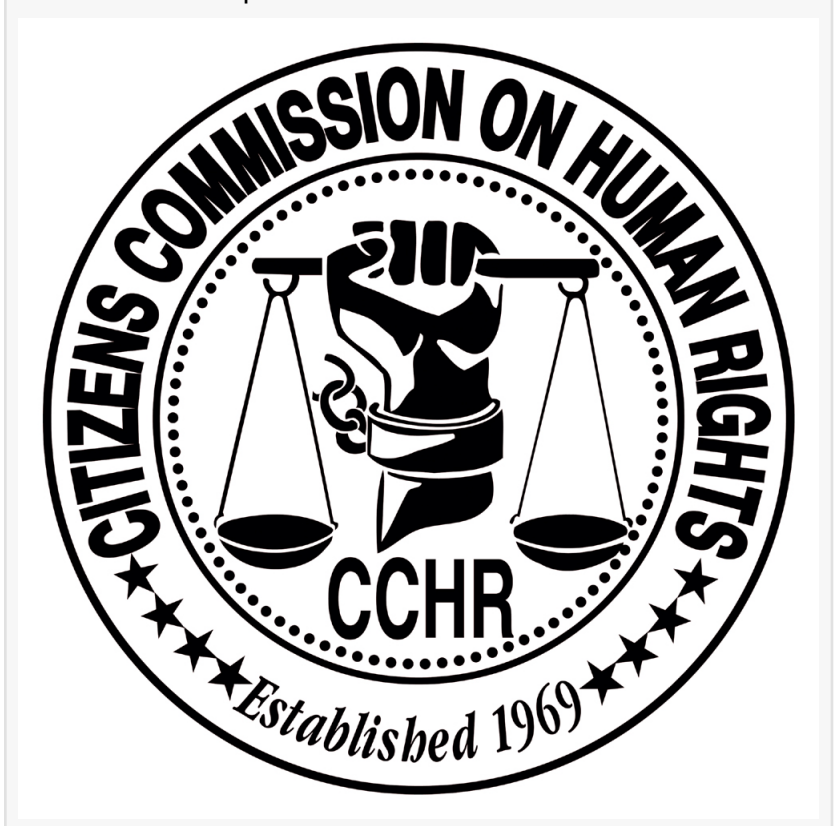
The Citizens Commission on Human Rights is a nonprofit mental health watchdog dedicated to the eradication of abuses committed under the guise of mental health.

Attorney General also described the psychiatrist as using "his position of power and authority to rape and demean our victim. His predatory acts deserve nothing less than the maximum sentence. It is my sincere hope that the defendant will spend the rest of his life behind bars so he is not allowed to hurt anyone again." [10]