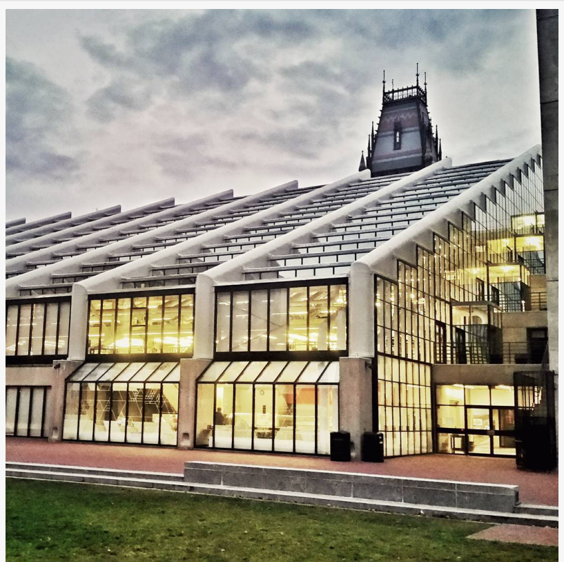
Harvard's Graduate School of Design