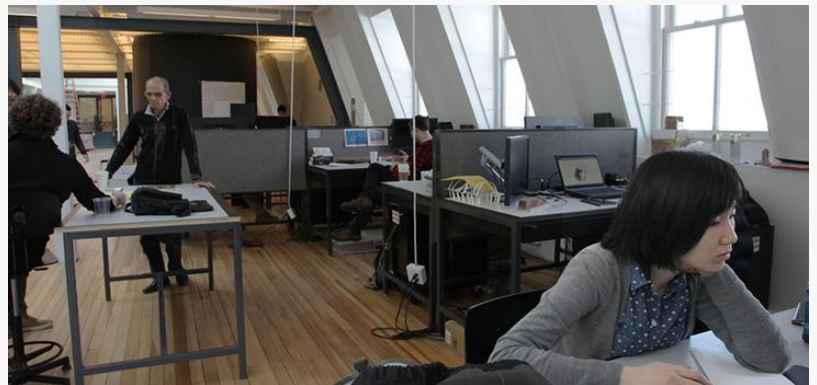
Cornell's Graduate School of Design