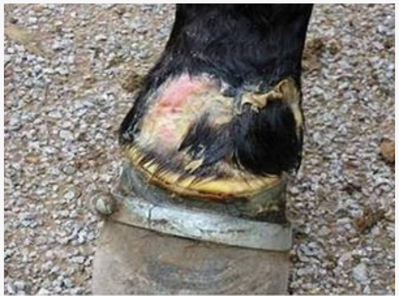
Example of soring that enforcement of the Horse Protection Act would prevent