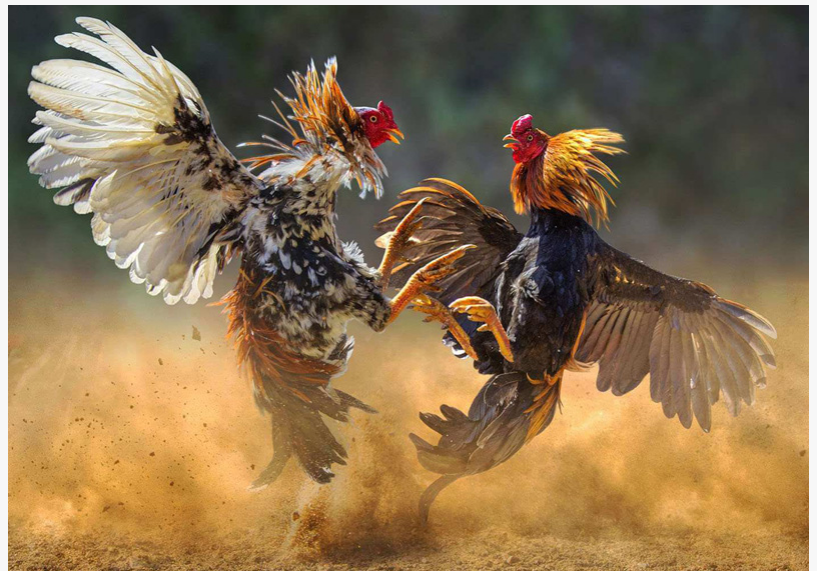
Cockfighting match the "Big Lick" is likened to by most of the show horse world

This press release can be viewed online at: http://www.einpresswire.com