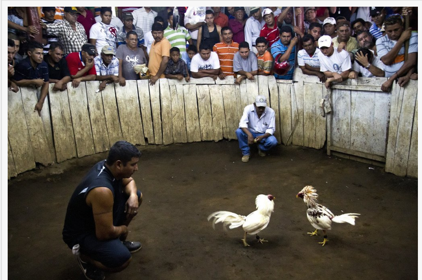
Cockfighting ring the "Big Lick" is likened to by most of the show horse world