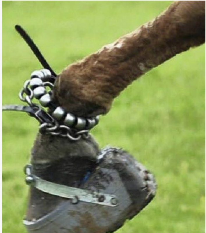
Devices the PAST Act would outlaw

The PAST Act has been blocked for years by a handful of well-placed lawmakers, but a new House rule triggering consideration of any measure that attracts 290 or more cosponsors brought the issue to the floor. PAST attracted 308 cosponsors and was led by Reps. Kurt Schrader and Ted Yoho (R-FL), cochairs of the Congressional Veterinary Medicine Caucus, along with Reps. Steve Cohen (D-TN), Ron Estes (R-KS), Jan Schakowsky (D-IL), and Chris Collins (R-NY). The Senate companion has garnered 43 cosponsors.