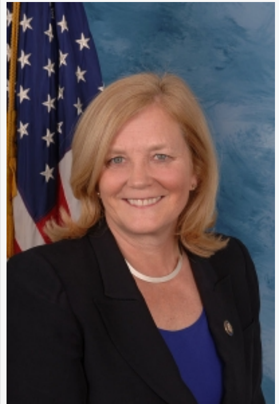
U.S. Rep. Chellie Pingree

The PAST Act has been blocked for years by a handful of well-placed lawmakers, but a new