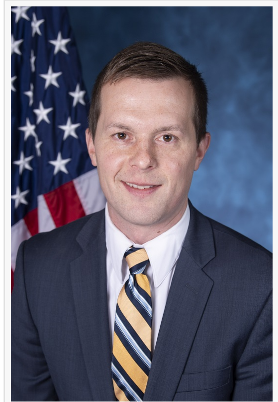
U.S. Rep. Jared Golden

The Animal Wellness Foundation (Foundation) is a Los Angeles-based private charitable organization with a mission of helping animals by making veterinary care available to everyone with a pet, regardless of economic ability. We organize rescue efforts and medical services for dogs and cats in need and help homeless pets find a loving caregiver. We are advocates for getting veterinarians to the front lines of the animal welfare movement; promoting responsible pet ownership; and vaccinating animals against infectious diseases such as distemper. We also support policies that prevent animal cruelty and that alleviate suffering. We believe helping animals helps us all.