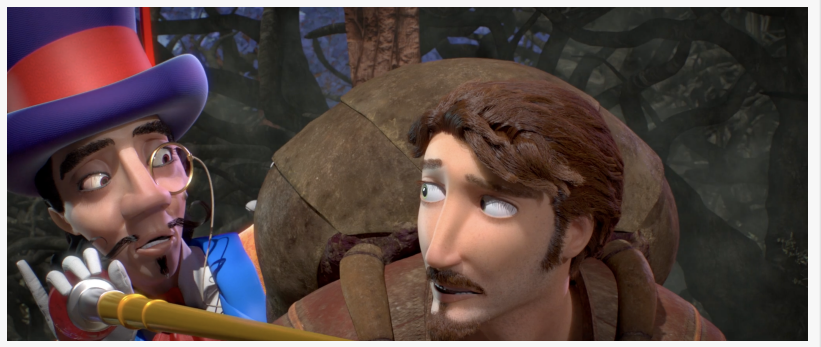
A screen shot of the film The Pilgrim's Progress -

Russia, Hindi, Tamil, Vietnamese, Urdu, Arabic, and other languages. The producers have a goal of translating the film into the world's 100 top languages which would make it the most translated animated film of all times.