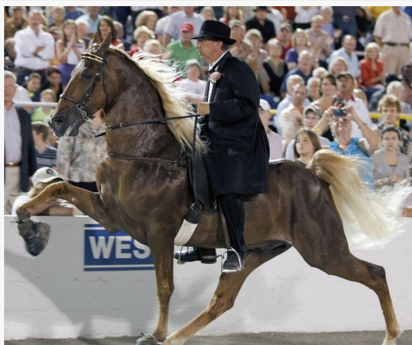
World Grand Champion Tennessee Walking Horse performing the "Big Lick"

The PAST Act seeks to strengthen the Horse Protection Act and end the torturous, painful practice of soring Tennessee Walking, Racking, and Spotted Saddle Horses. Soring, the intentional infliction of pain to horses' front limbs by applying caustic chemicals such as mustard oil or kerosene or inserting sharp objects into the horses' hooves to create an exaggerated gait known as the "Big Lick," has plagued the equine world for six decades. The "Big Lick" animal cruelty will be on display beginning tonight at The Tennessee Walking Horse National Celebration in Shelbyville, Tennessee.