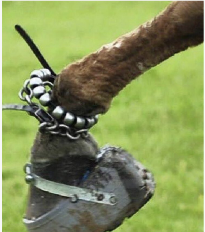
Devices the PAST Act would outlaw

The PAST Act has been blocked for years by a handful of well-placed lawmakers, but a new House rule triggering consideration of any measure that attracts 290 or more cosponsors brought the issue to the floor. PAST attracted 308 cosponsors, and was led by U.S. Reps. Kurt Schrader (D-OR) and Ted Yoho (R-FL), cochairs of the Congressional Veterinary Medicine Caucus, along with Reps. Steve Cohen (D-TN), Ron Estes (R-KS), Jan Schakowsky (D-IL), and Chris Collins (R-NY). The Senate companion has garnered 43 cosponsors.