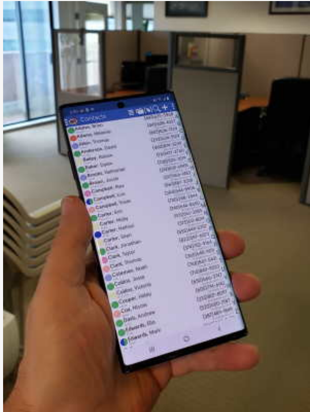
DejaOffice Contacts on Galaxy Note 10