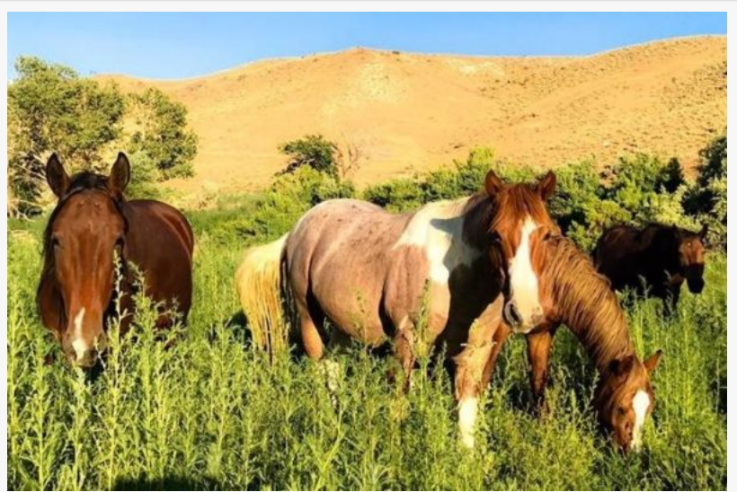
Horse Family 2

of locations for treatment of sick horses or those injured on the road, etc.. This plan; providing a network of locations for these majestic migratory animals to navigate could potentially minimize their exposure to the main cause of injury and death which are highways and roads on their migratory route. This type of program and care would only be done with complete approval of the Department of Agriculture and other related government entities.