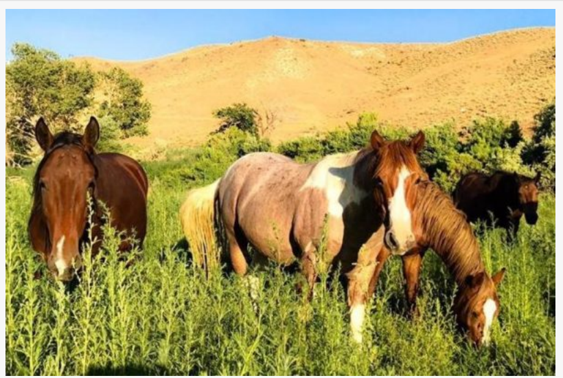
Horse Family 2

of locations for treatment of sick horses or those injured on the road, etc.. This plan; providing a network of locations for these majestic migratory animals to navigate could potentially minimize their exposure to the main cause of injury and death which are highways and roads on their migratory route. This type of program and care would only be done with complete approval of the Department of Agriculture and other related government entities.