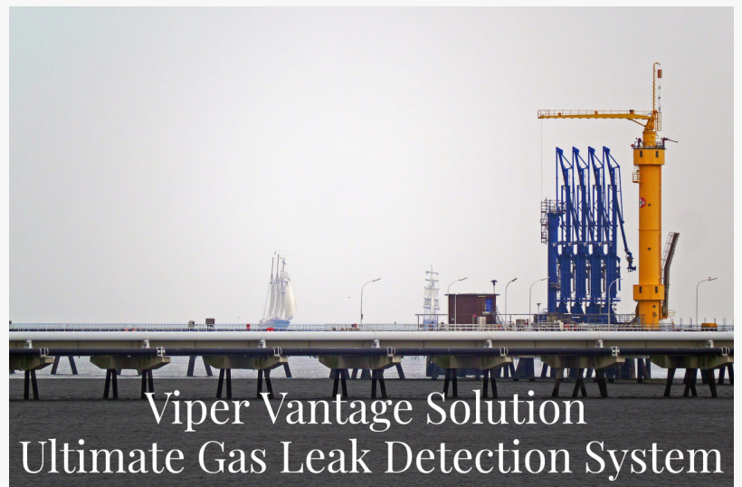
Viper Vantage - Ultimate Gas Leak Detection System - Production Facilities Inspection.