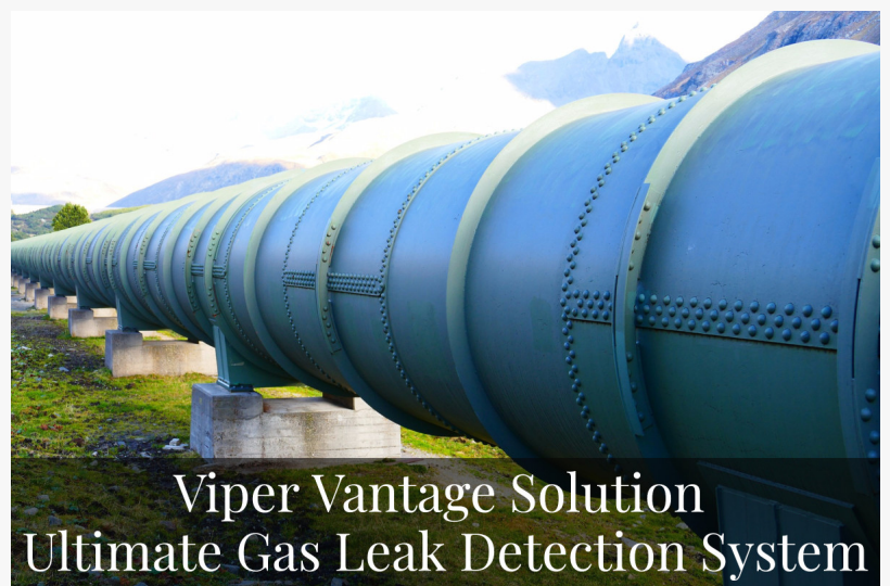
Viper Vantage - Ultimate Gas Leak Detection System - Extended Pipeline inspection