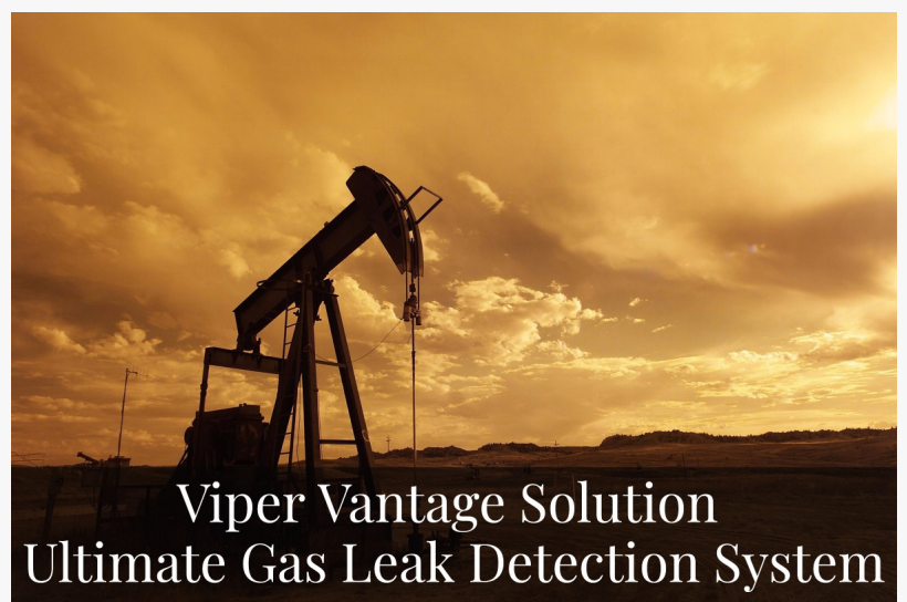
Viper Vantage - Ultimate Gas Leak Detection System

Viper Drones is a leading Drone Systems Integrator and Services company specializing in the integration of FLIR thermal imaging technology on drone systems, based in Melbourne, Florida. Founded in 2015 to help customers in a broad set of verticals, including the Oil, Gas and Energy industry; Building, Industrial, Manufacturing and Utility inspections; Agricultural and Public Health Spraying; Surveillance; and Geographical Surveying. Viper Drones merged with My Drone Services Inc. in 2017. The philosophy of Viper Drones is to serve customers with specialized Remote Piloted Aerial System (RPAS) solutions that will save lives, time, and expense.