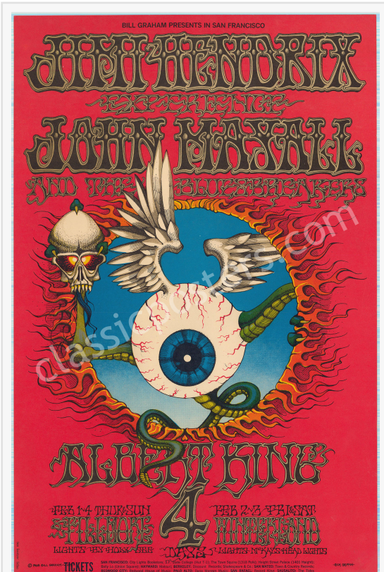
Stunning Original BG-105 Jimi Hendrix Flying Eyeball Poster