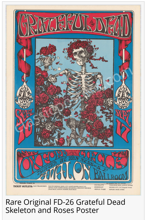
Rare Original FD-26 Grateful Dead Skeleton and Roses Poster

• A superb original Family Dog FD-26 Grateful Dead poster. This features the skeleton and roses design that became the Dead's trademark.