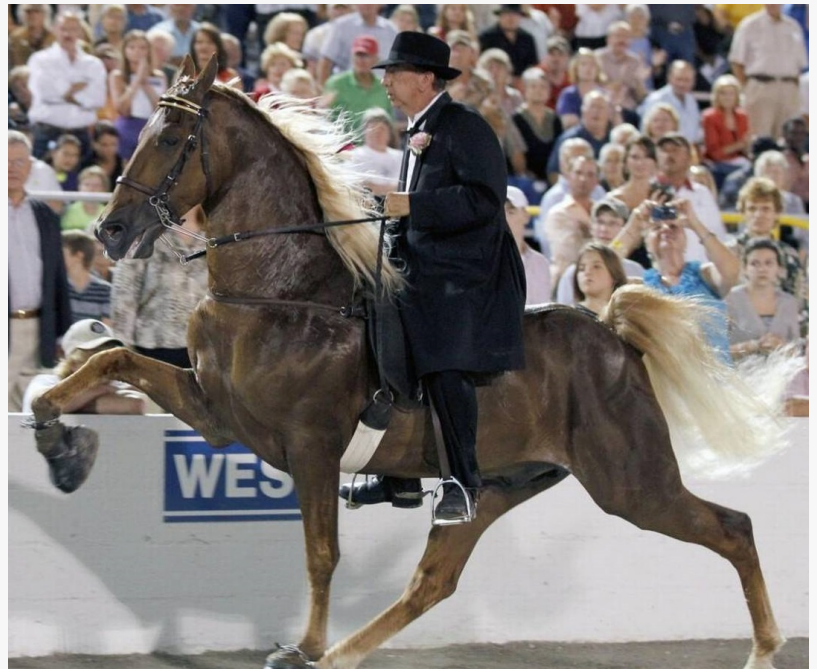
World Grand Champion Tennessee Walking Horse performing the "Big Lick"