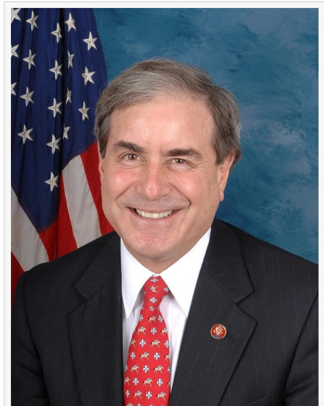
Rep. John Yarmuth

The PAST Act seeks to strengthen the Horse Protection Act and end the torturous, painful practice of soring Tennessee Walking, Racking, and Spotted Saddle Horses. Soring, the intentional infliction of pain to horses' front limbs by applying caustic chemicals such as mustard oil or kerosene or inserting sharp objects into the horses' hooves to create an exaggerated gait known as the "Big Lick," has plagued the equine world for six decades. The "Big Lick" animal cruelty will be exhibited for the next 4 days at the Tennessee Walking Horse National Celebration in Shelbyville, Tennessee.