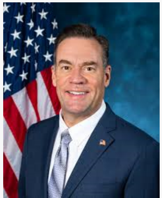
Rep. Russ Fulcher

U.S. Senator Mike Crapo is the lead sponsor of the Senate companion bill that mirrors the House passed legislation and currently has 43 cosponsors in the Upper Chamber. U.S. Senator James Risch, the junior Senator from Idaho, has yet to cosponsor the bill.