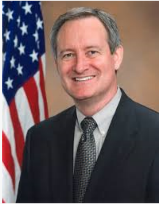
Senator Mike Crapo

Animal Wellness Action (Action) is a Washington, D.C.-based 501(c)(4) organization with a mission of helping animals by promoting legal standards forbidding cruelty. We champion causes that alleviate the suffering of companion animals, farm animals, and wildlife. We advocate for policies to stop dogfighting and cockfighting and other forms of malicious cruelty and to confront factory farming and other systemic forms of animal exploitation. To prevent cruelty, we promote enacting good public policies and we work to enforce those policies. To enact good laws, we must elect good lawmakers, and that's why we remind voters which candidates care about our issues and which ones don't. We believe helping animals helps us all.