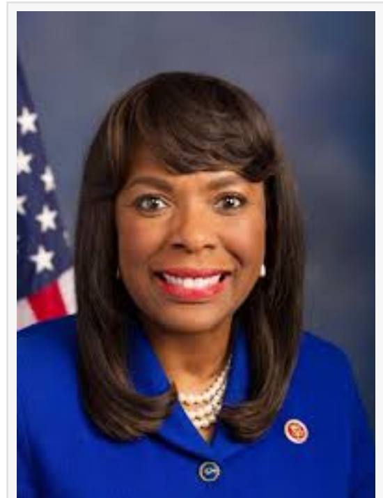
Rep. Terri Sewell

The Alabama Racking Horse was recognized by the USDA in 1971. It is known for a distinctive single-foot gait. In 1971, the Racking Horse Breeders' Association of America, headquartered in Decatur, Alabama, was formed as the breed registry. Its goal is to preserve the breed in a natural state with little or no artificial devices that enhance gait, and the PAST Act would eliminate the artificial devices currently used in Racking Horse shows such as the World Celebration held in Priceville in September.