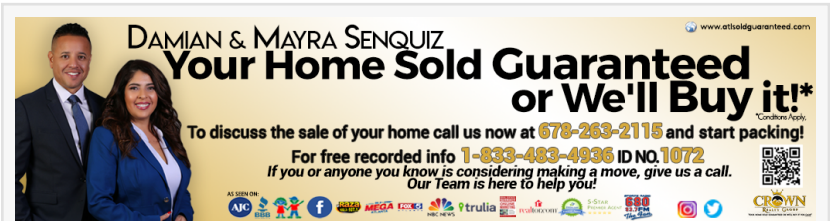
Your Home Sold Guaranteed or We'll Buy it Banner