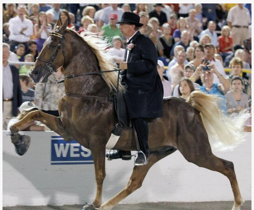
World Grand Champion Tennessee Walking Horse performing the "Big Lick"

Animal Wellness Action (Action) is a Washington, D.C.-based 501(c)(4) organization with a mission of helping animals by promoting legal standards forbidding cruelty. We champion causes that alleviate the suffering of companion animals, farm animals, and wildlife. We advocate for policies to stop dogfighting and cockfighting and other forms of malicious cruelty and to confront factory farming and other systemic forms of animal exploitation. To prevent cruelty, we promote enacting good public policies and we work to enforce those policies. To enact good laws, we must elect good lawmakers, and that's why we remind voters which candidates care about our issues and which ones don't. We believe helping animals helps us all.