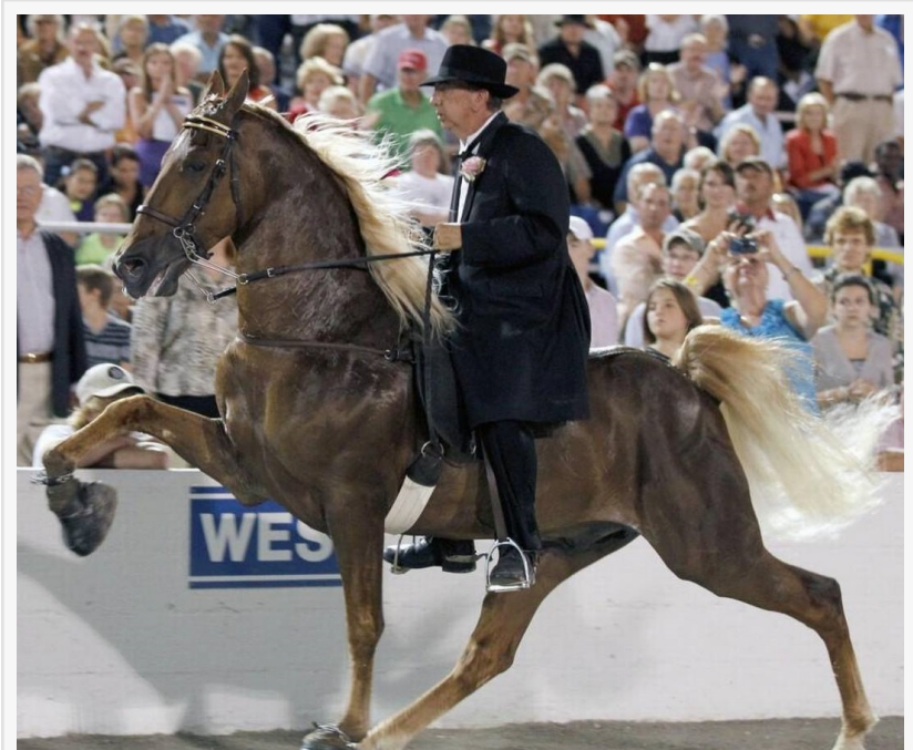
World Grand Champion Tennessee Walking Horse performing the "Big Lick"

The PAST Act would ban the use of painful large stacked shoes and ankle chains and would also eliminate the existing system of self-regulation by the industry and toughen penalties for violators of the Horse Protection Act. It's supported Animal Wellness Action, the American Horse Council, American Veterinary Medical Association, American Association of Equine Practitioners,