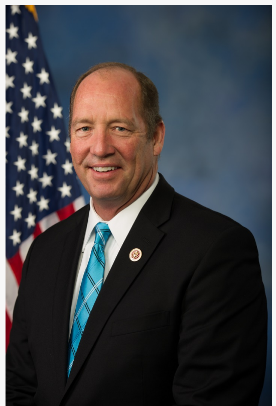
U.S. Rep. Ted Yoho, DVM, lead Republican sponsor of the PAST Act

Neither U.S. Senators Marco Rubio nor Rick Scott are cosponsors of the Senate companion bill, S. 1007, led by the senior U.S. Senator from Idaho, Republican Mike Crapo, that mirrors the House passed legislation and currently has 43 cosponsors in the Upper Chamber, but Rubio was a cosponsor of the bill in the 113th Congress.