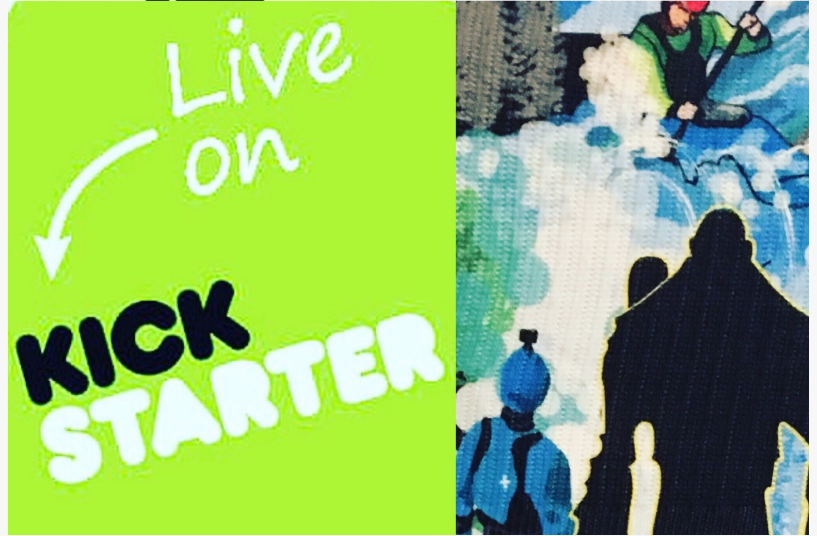
SockGen on Kickstarter