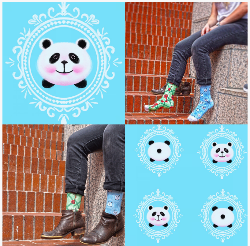
Add dimension to any outfit!

This press release can be viewed online at: http://www.einpresswire.com