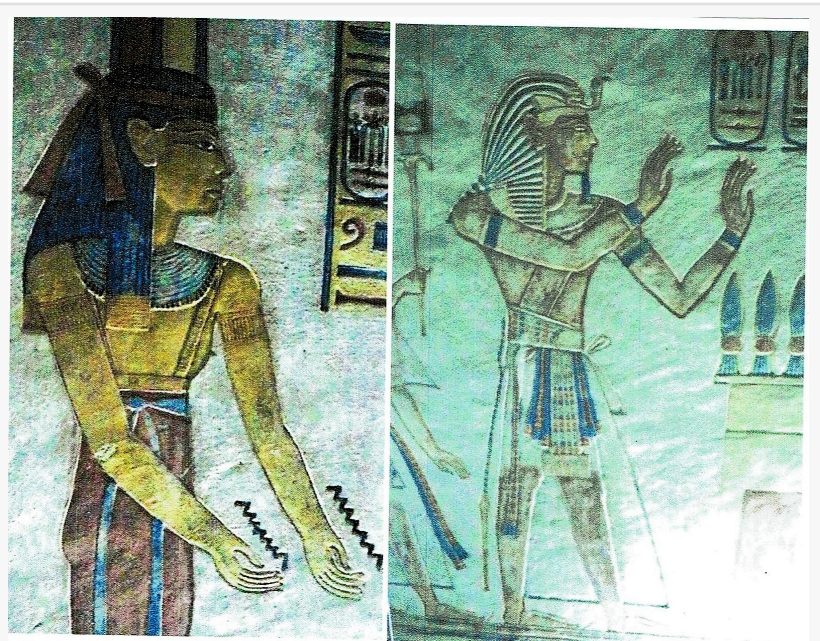
Goddess & Pharaoh with right & left hands

The image of the goddess from a tomb in the Valley of the Queens has two left hands and jagged lines are shown above her outstretched arms and hands. The conventional translation of this hieroglyphic symbol is "water." Sometimes this symbol has a single jagged line, sometimes two